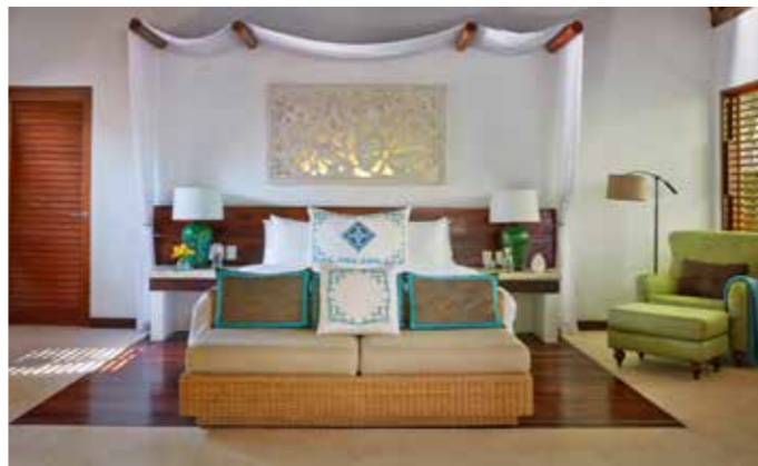
Above: Ocean View Villa Patio Far Left: Premium Villa Soaking Tub Left: Royal Villa Guestroom