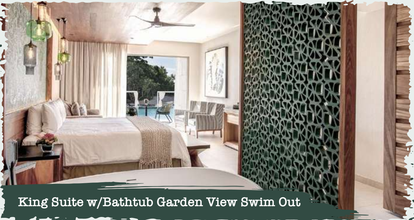
King Suite w/Bathtub Garden View Swim Out