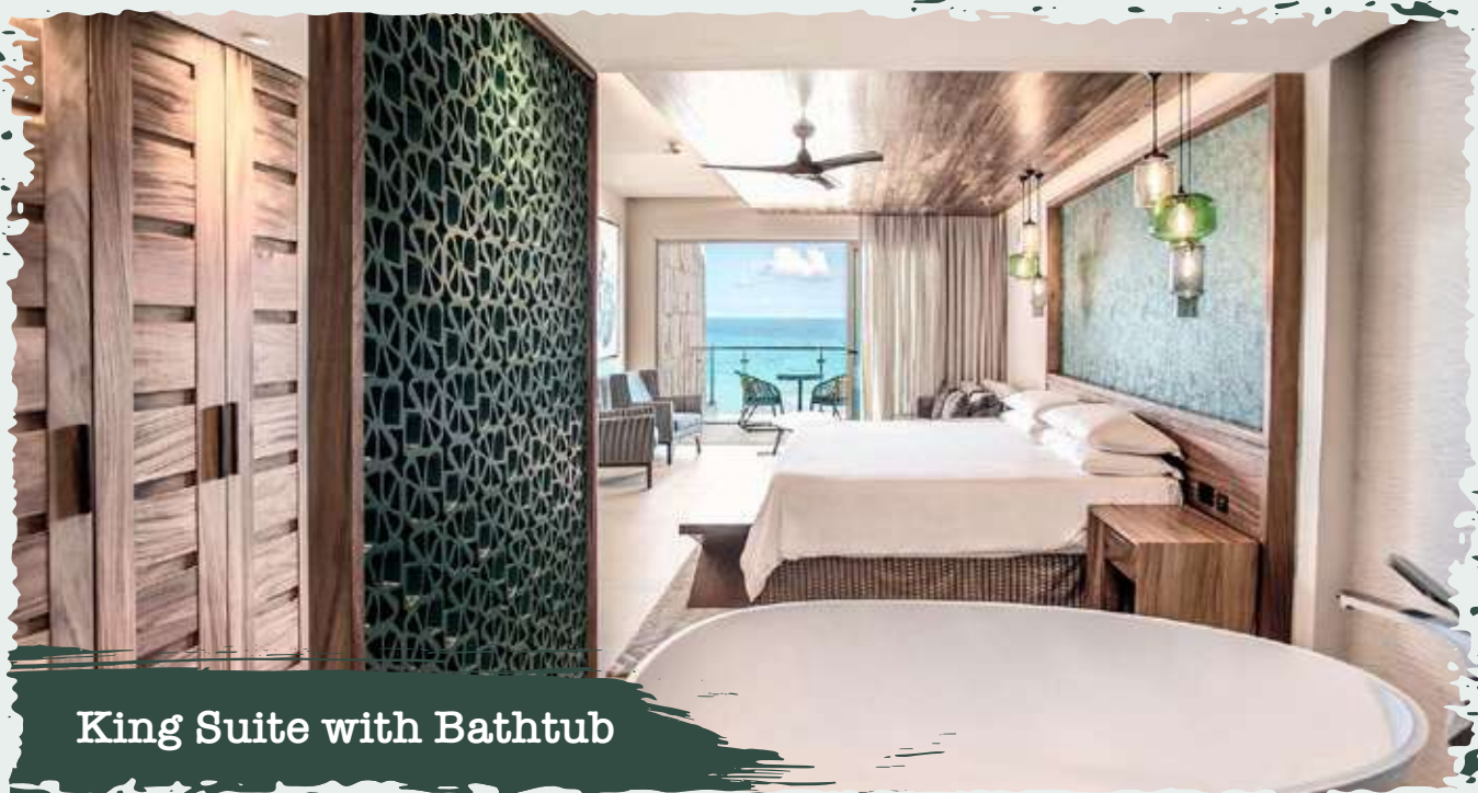
King Suite with Bathtub