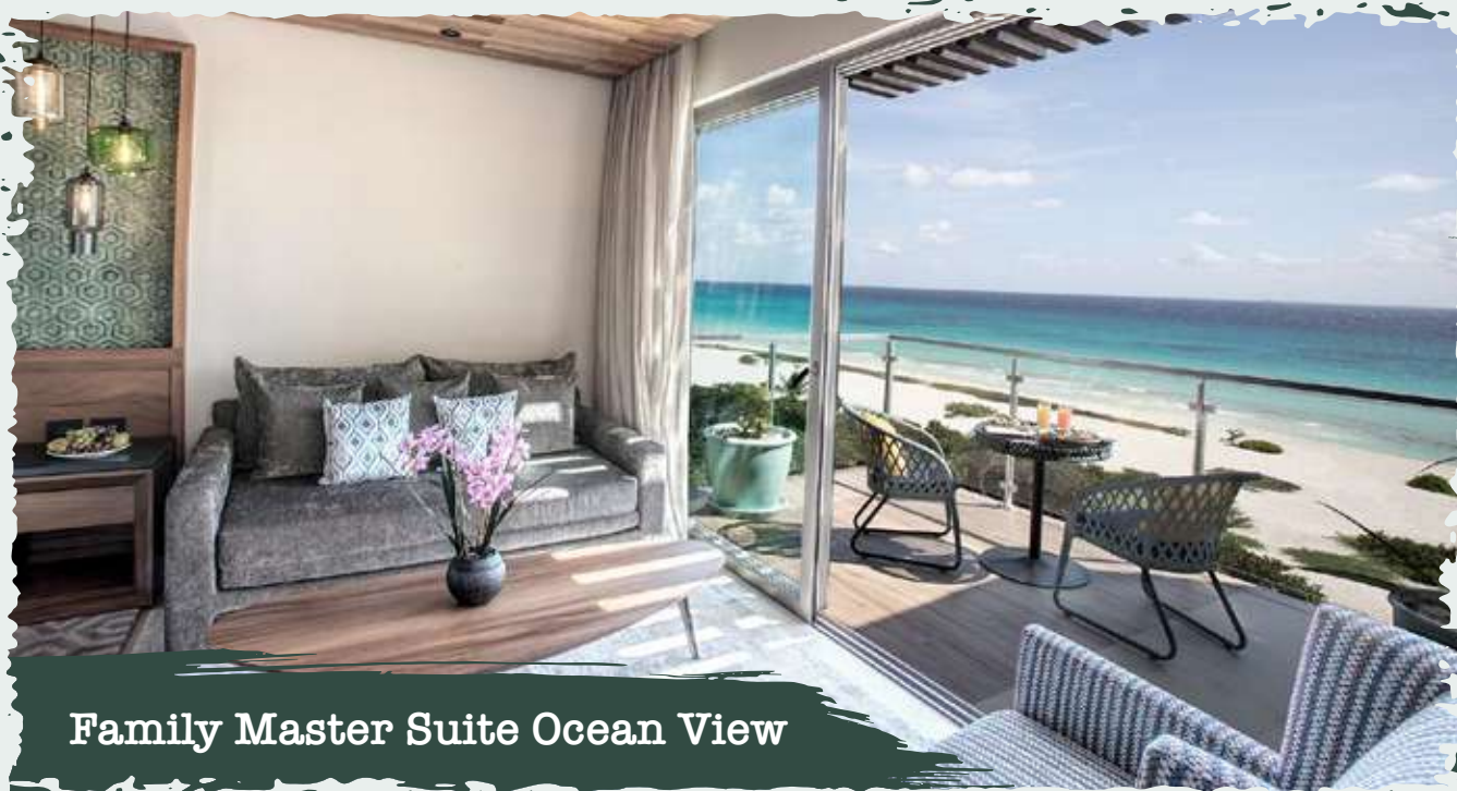
Family Master Suite Ocean View